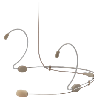
TG H56 tan